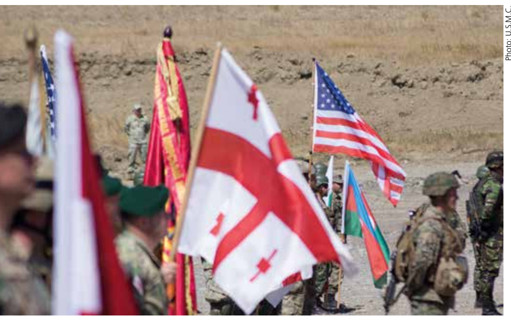
The US holds two major military exercises annually on Vaziani military base – Agile Spirit and Noble Partner. Depicted are Georgian, US and Azerbaijani troops during the opening ceremony for Exercise Agile Spirit in Orpholo, Georgia, 3 September 2017.

training the Georgian military for the Afghanistan mission and began training the Georgian military for the territorial defence of Georgia in May 2018. Georgia's acquisition of JAVELIN portable anti-tank systems in January 2018 was indeed a milestone