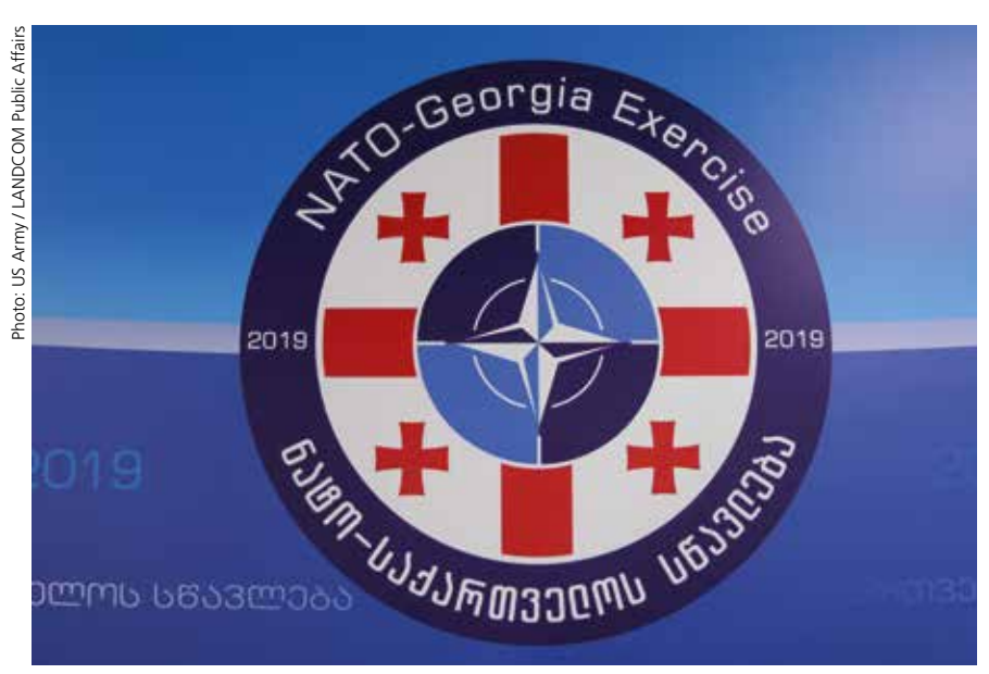
The logo for the NATO-Georgia Exercise at the NATO-Georgia Joint Training and Evaluation Centre in Krtsanisi National Training Centre

security of the United States and the enhanced security of Georgia. It underlines Georgia's importance for US foreign and security policy and underlines the American understanding that such a limited sale of defence systems to Georgia would not be a turning point. At the same time, the US signalled to Russia that it was willing to supply defensive weapons to Georgia, a signal which was perceived in Moscow. The sale of JAVELIN anti-tank missiles is therefore a milestone in relations between Georgia and the USA. Until the announcement of the DSCA, the US Government hesitated to sell defensive weapons to Georgia, because Georgia was not seen