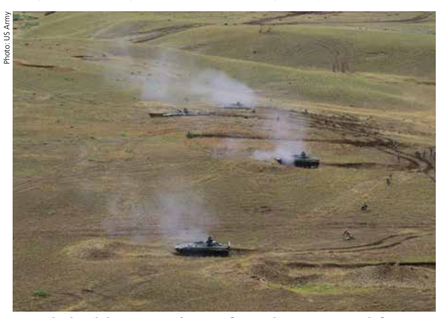
At Vaziani Training Area, a platoon of Georgian Army BMP-2 infantry fighting vehicles firing during a combined arms live fire exercise with US troops. The exercise was part of Noble Partner 18.

as a responsible actor on the international stage and in order not to aggravate the unsafe relations between the US and Russia and because of an unofficial arms embargo against Georgia after the war of August 2008. Undoubtedly, the illegal Russian annexation of the Crimea in March 2014 was an additional factor that prompted the US Government to reconsider and eventually sell JAVELINs to Georgia. Whether the US will sell more JAVELINs or not remains to be seen. However, such a sale is no longer completely unlikely. The Trump government has revitalised military relations between Georgia and the US, which had been neglected by the Obama administra-