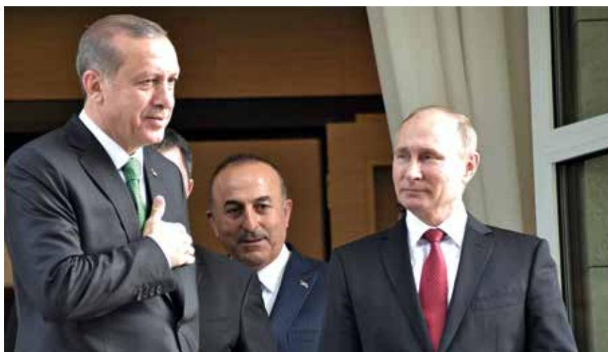
On 13 November 2017, Vladimir Putin met with President of Turkey Recep Tayyip Erdogan in Sochi to discuss bilateral relations and current issues on the international agenda.