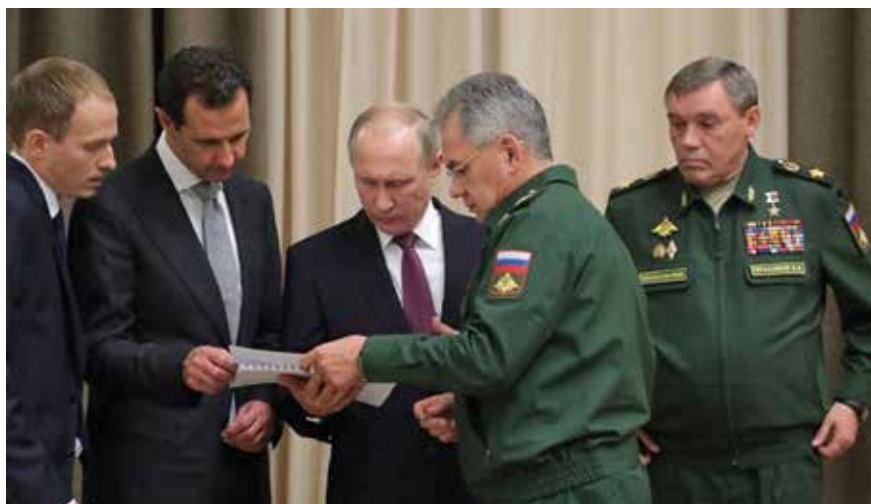
Russian President Vladimir Putin and Syrian President Bashar al-Assad met with representatives of the Russian Defence Ministry to discuss Russian "counter-terrorism operations" in Syria.