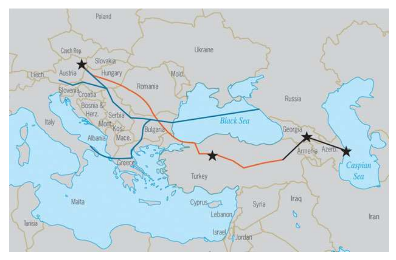
Liberetto: Today's gas war is a zero-sum conflict similar to the scramble for resources that divided Eurasia in the 19th century. Planned pipeline Nabucco would carry up to 1.1 trillion cubic feet of natural gas a year from the Caspian Basin to Vienna, traversing many a former Soviet satellite along the way. A competing Russian project, South Stream, would flow from Russia across the Black Sea and ultimately terminate in Italy and Austria.

One evening in 2002 in Vienna, a small group of Austrian energy executives took their colleagues from Turkish, Hungarian, Bulgarian, and Romanian firms to see a rarely performed Verdi opera. It recounted the plight of Jews expelled from Mesopotamia by King Nebuchadnezzar. The officials had spent the day sketching out a plan for a 2,050-mile pipeline that could transport up to 1.1 trillion cubic feet of natural gas every year across their countries and into European markets. The sources of this gas would not be Russia, but Azerbaijan, maybe Iran one day, and with a U.S.-led war against Saddam Hussein looking increasingly likely, possibly the gas fields of northern Iraq. The opera they attended that night was called Nabucco , and that is the name they gave their pipeline.